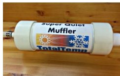
14-0010 Super Quiet Muffler (SQM)