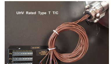
Ultra High Vacuum CF Flanged Feed Thru with