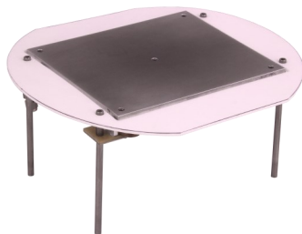
Custom Vacuum Capable SD49 6.5" x 7.5" Test Surface There are other Sizes Available

Greatly reduces the noise level of coolant being spent by a Thermal Platform