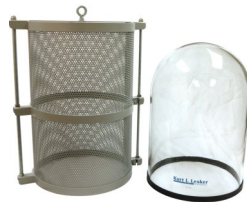
Bell Jar Cage