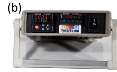
(b) Watlow PM6 is a very robust, economical controller