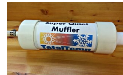
14-0010 Super Quiet Muffler (SQM) Greatly reduces the noise level of coolant being spent by a Thermal Platform.