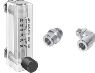
Simple needle valve flowmeter