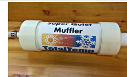
14-0010 Super Quiet Muffler (SQM)

Greatly reduces the noise level of coolant being spent by a Thermal Platform