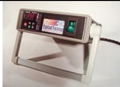
TotalTemp also offers the EZ-ZONE PM Controller a cost-effective temperature controller for manual single setpoint

More Options & Accessories: https://www.totaltemptech.com/thermal-platforms-coldplates-options-and-accessories/