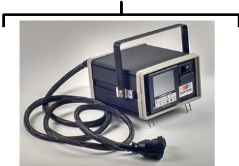
Nano Controller in standard housing with Custom Length Umbilical