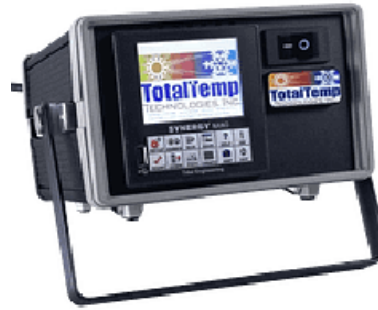
Benchtop Configuration , shown with feet and tilt stand is 5-1/2" x 10" x 10"