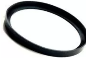
L Gasket for Bar Jar Seal