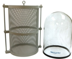
Bell Jar Cage