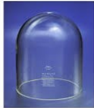
Pyrex Bell Jar