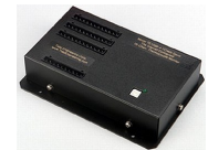
28-00101 Data logger with 16 Channel Type T Thermocouple Temperature Sensors