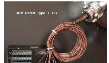
Ultra High Vacuum CF Flanged Feed Thru with