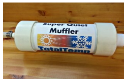
14-0010 Super Quiet Muffler (SQM)

Greatly reduces the noise level of coolant being spent by a Thermal Platform