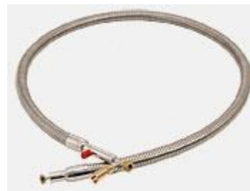
Coolant Delivery Hoses For Use With Cryogenic Fluids Pressure Relief Valve for added safety