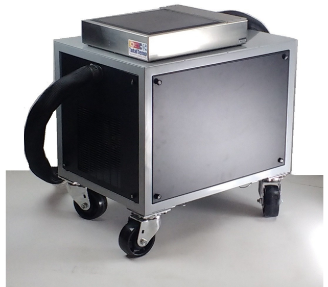
SC144-NR Thermal Platform with remote refrigeration chassis. Allows Platform to be positioned for bench-top or integrated applications.