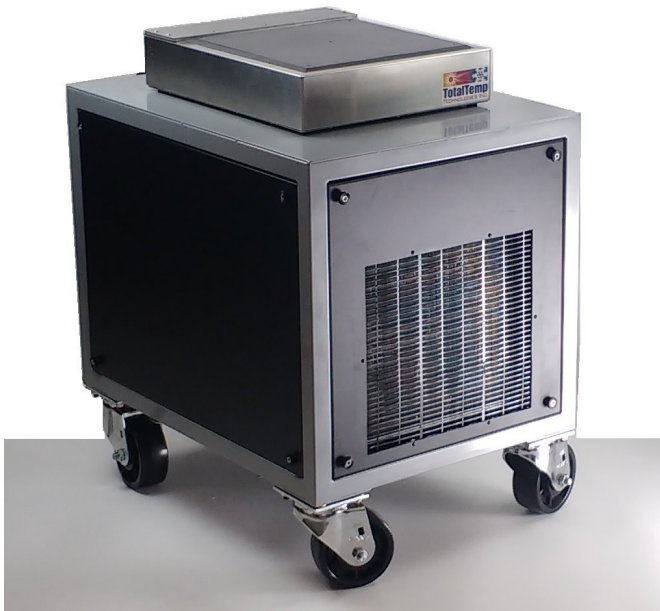
SC144-NS Thermal Platform with stand-alone attached refrigeration chassis. (Controller not shown)

Bench top, stand-alone or remote compressor configuration