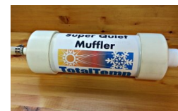
14-0010 Super Quiet Muffler (SQM)

Greatly reduces the noise level of coolant being spent by a Thermal Platform