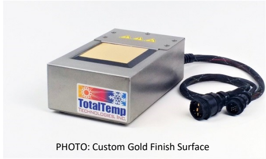
PHOTO: Custom Gold Finish Surface

THERMAL PLATFORM USED FOR PRECISION TEMPERATURE TEST