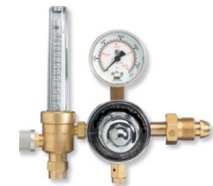
Dry Nitrogen Purge Regulator with Flowmeter