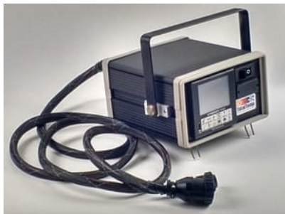
Nano Controller in standard housing with Custom Length Umbilical