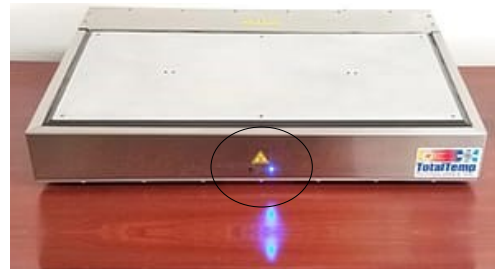
Controller can indicate Hot/Cold safety status at platform panel (SD288 Thermal Platform shown has a 12" x 24" surface)