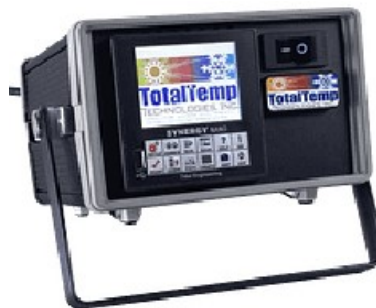
Benchtop Configuration, shown with feet and tilt stand is 5-1/2" x 10" x 10"