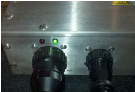
1- Failsafe Working, Normal operation

All TotalTemp systems have a fixed bimetal thermostat that latches power off for heating and cooling circuits in the event that temperatures exceed 205°C. On the rear electrical interface panel of the plate chassis, there are two LED indicator lights. The green LED light indicates power to the safety thermal switch and should always be on during normal operation. The red LED light indicates the thermal safety switch has tripped due to an over-temperature condition. It is only safe to use the system if the green light is on and the red light is off. If the system is turned ON and there are any other combinations of LED states besides Green ON and Red OFF, first cycle remove system power until the problem is resolved.